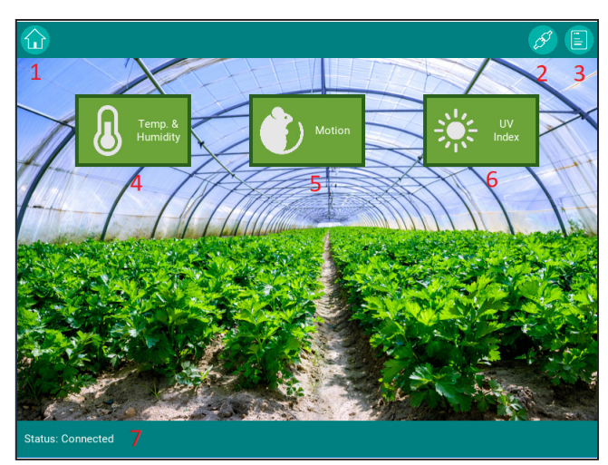
Figure 3. Main display of the MAXREFDES9000 GUI.